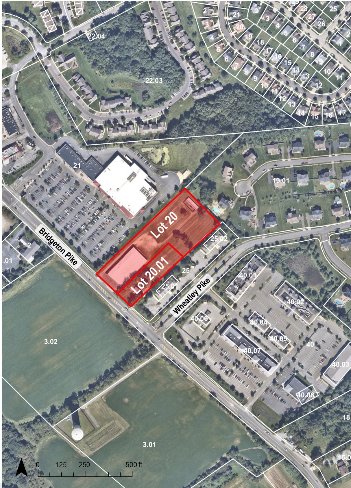
Figure 1. Redevelopment Plan Site