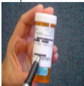
Mark out personal information