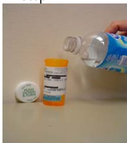
Mix with water and coffee grinds, cat litter, or dirt