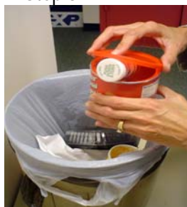
Place in opaque container